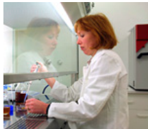
Basic Research / Research Institutes